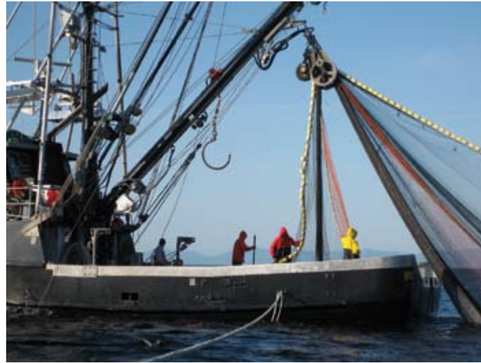
▲ The crew of Fishing Vessel Heavy Duty at work hauling in wild Alaskan salmon.

The environmental issues surrounding farmed fish are convoluted and multifaceted, but can be simplified to a few categories: pollution, disease and fishmeal production.