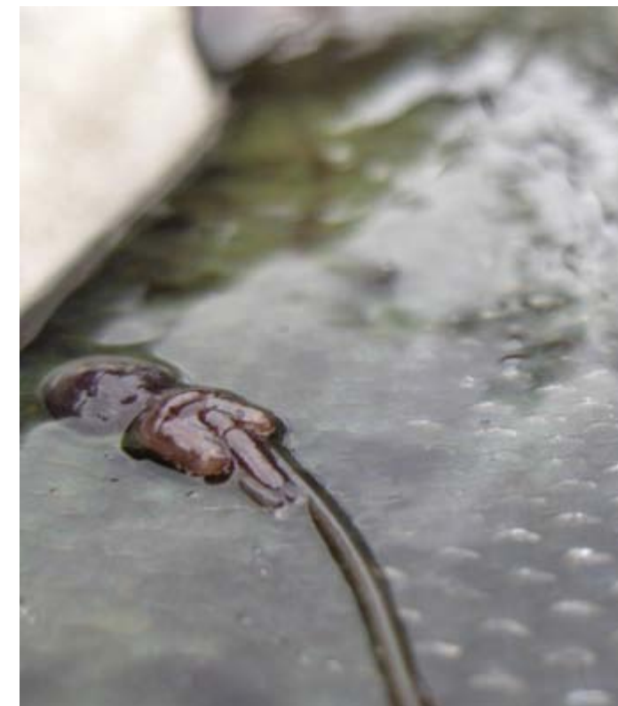
▼ A sea louse on a wild pink salmon

"These fish could provide humans with large quantities of protein but we waste them by using them as raw material for fishmeal," Pauly said.