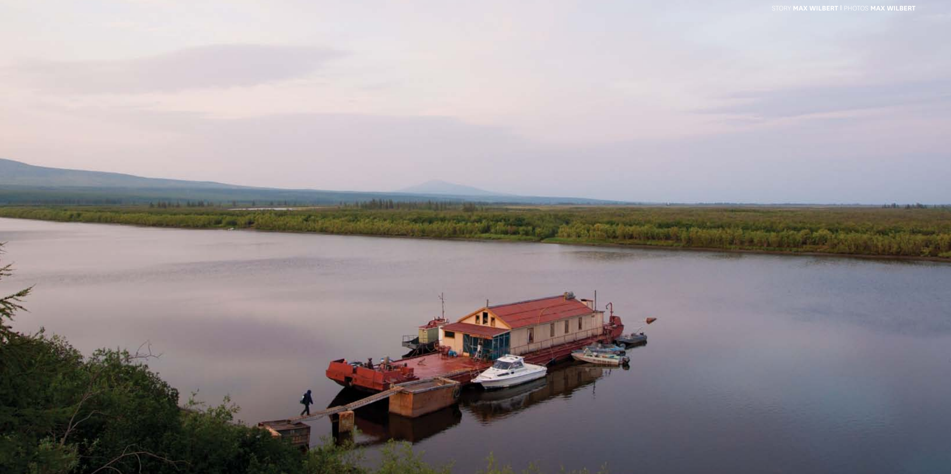
The long Arctic twilight paints pink hues on the barge that houses the researchers of The Polaris Project, as one researcher finally arrives home after a long night in the lab.