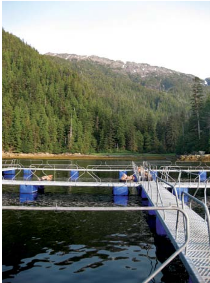
▲ Open net pens at a chum salmon hatchery located in Kendrick Bay, Alaska.