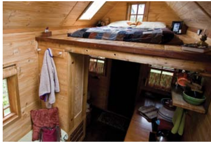
▲ Dee Williams' home has a footprint the size of an elevator. The tall living room ceiling and windows on every wall illuminate the area, creating an open and comfortable space.

Dee Williams lives in a tiny house in Olympia, Wash. with a total area of 84 square feet and a living room the size of an elevator.