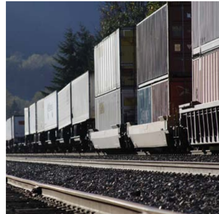
▲ A stationary, east-facing BNSF train waits in Goldbar, Wash.

Bellingham has its own environmental cleanups, Skipper said. However, she said these are not associated with the railroad, even though some occur near tracks. Boulevard Park and other cleanup sites in Bellingham stem primarily from the