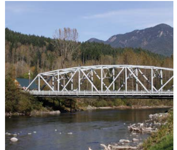
▲ The Skykomish River, with the bridge that crosses it into the town of Skykomish, Wash. Bunker C fuel was discovered to be seeping into the salmon habitat of the Skykomish River in 1996. The oil had been pooling underneath the buildings of the town, accumulating in the soil.

Melonas said a ton of freight moved on a rail car can move more than 450 miles on a single gallon of diesel, equivalent to