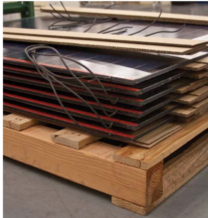
▲ A stack of fully-assembled solar panels at Silicon Energy in Marysville, Wash.